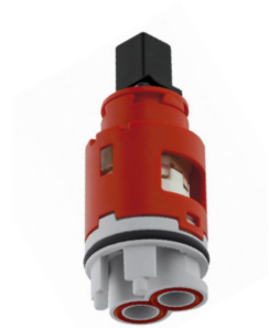
VDAPT19 25mm High Flow - Hydroplast FX25