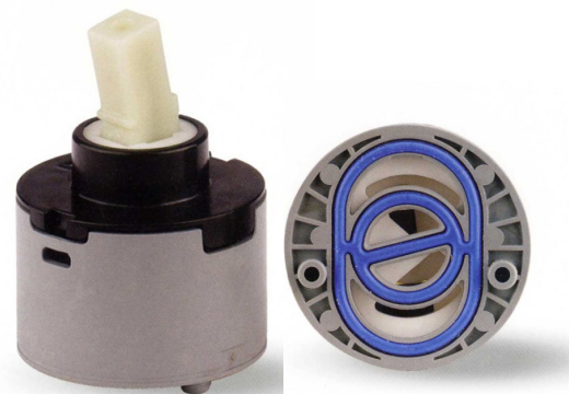
VDAPT300 Vortex 47mm - Galatron G13UK