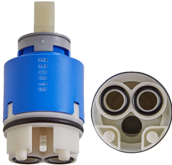
FORPT125 35mm with Distributor Base - Kerox K-35B