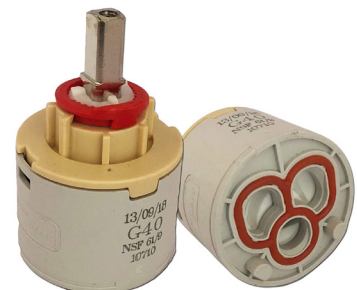
FORPT22 40mm Flatbase - Hydroplast G40, standard replacement for all 40mm Foreno