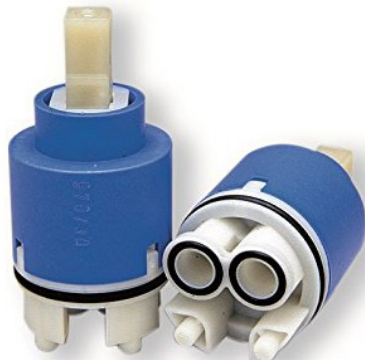
FORPT127 40mm with Distributor Base - Kerox K-40B