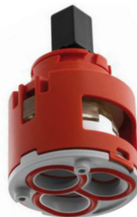
VDAPT17 40mm High Flow - Hydroplast F40, replacement for all 40mm Voda, upgrade for 40mm Foreno