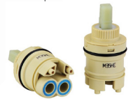
VDAPT139 35mm with Distributor base for North/Soul/Tide/Symphony/Vienna Basin Mixer - Citec CT35UH001