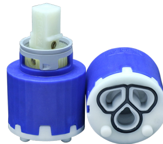
VDAPT73 35mm Cold Start - KEROX NKJ-35