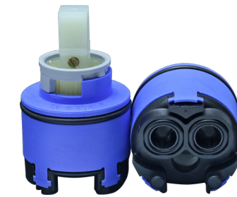
FORPT196 35mm for Solitaire Sink/ Basin Mixer - KEROX K-35OP